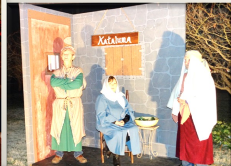
Look at these snazzy dressers coming in to see the Benton UMC Choir's cantata: